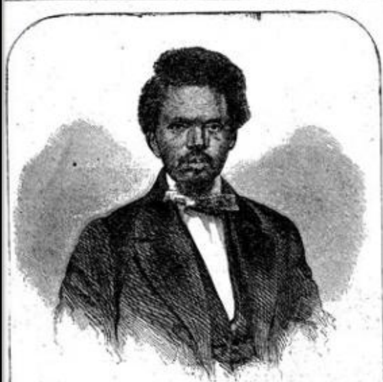
ROBERT SMALLS, CAPTAIN OF THE GUN-BOAT "FLANTER."